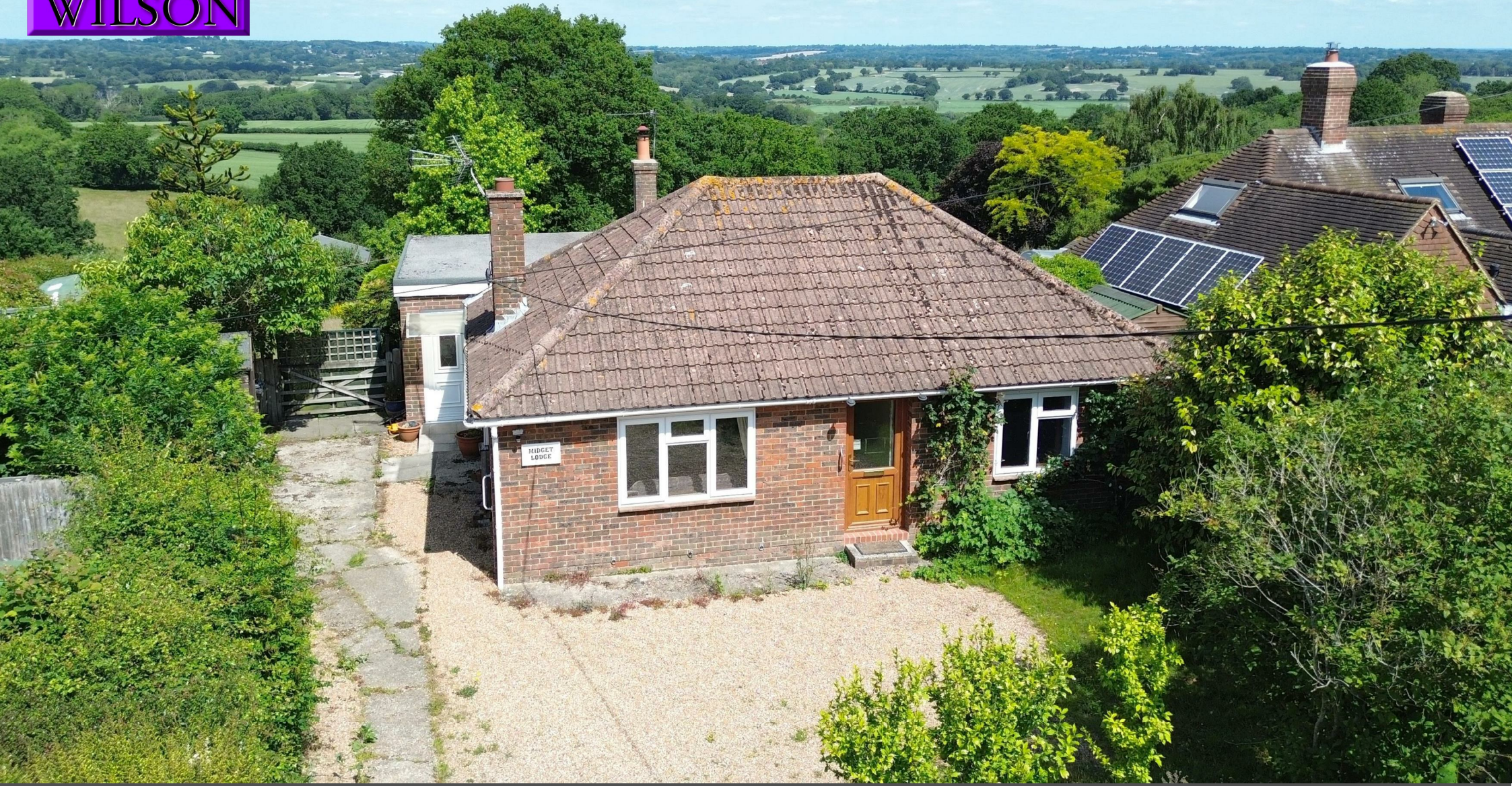
Midget Lodge, Dixter Lane, Northiam, East Sussex TN31 6PP. £495,000 Freehold